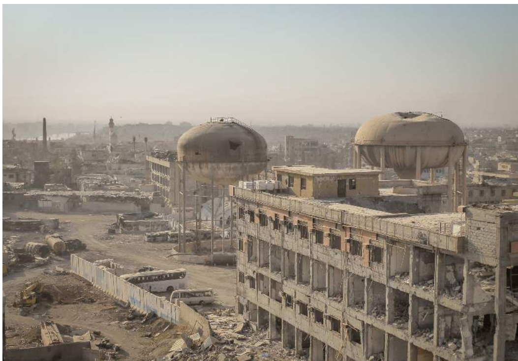
A view of part of the Al-Shifa complex in 2017

During the last phase of the conflict with ISIS, the group used the Al-Shifa hospital complex in West Mosul as its headquarters. The complex is located on the right (West) bank of the river Tigris adjacent to the Old City, where the final stages of the conflict took place. As documented elsewhere, 45 the damage sustained to West Mosul and the Old City in particular by the final offensive was immense. 46 This damage came primarily from the heavy use of explosive weapons including airstrikes, artillery and rocket barrages by forces allied with the Iraqi government, as well as the use of improvised explosive weapons by ISIS. One clearance operator working in the Old City area after the conflict informally estimated that around two fifths of the resulting unexploded ordnance and remnants to clear were from ISIS, and three fifths from liberating forces.